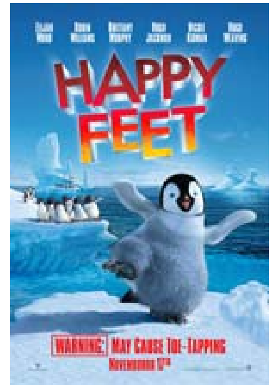
Over Fishing Plastic Pollution Global Warming